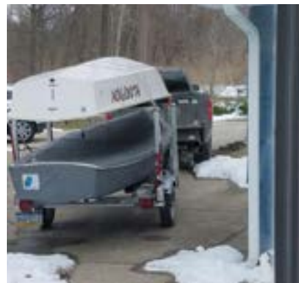
Florida or BUST!