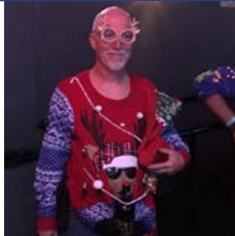
Santafest, Sweaters and Shenanigans. Oh my!

It's time to uncover your boat, check your gear, and trailer. Sailing season is almost here! Start signing up for some regattas!!!! Bring your family, friends, and join in the fun. We have a lot of events on the schedule already, come on out and explore new venues with your Windmill family!