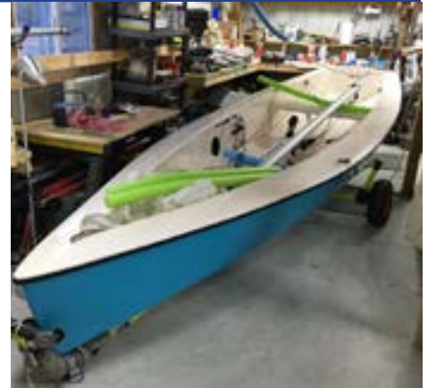
#5709 is born!