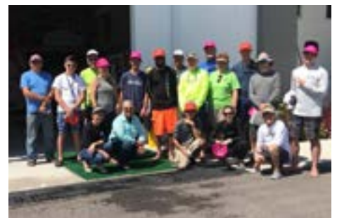
Congratulations to the newly chartered Fleet for hosting their first regatta!