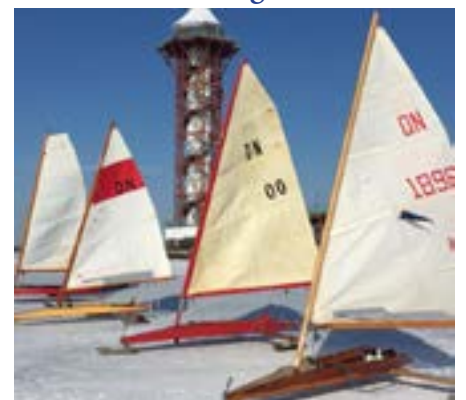
A little bit of snow couldn't bury the sailors in Erie.