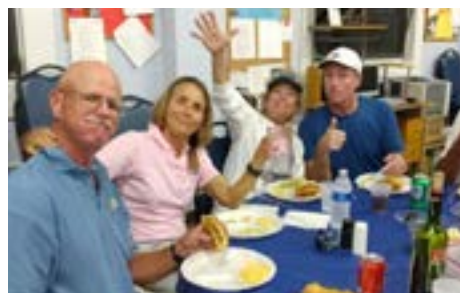
Boca Ciega & Good friends. Roger that!

The Windmill Class is incorporated in the state of Maryland Articles for Tax Exemption, our MD Department ID# D06127773. Our Non-Profit Federal Employer ID number is ID# 47-2704921.